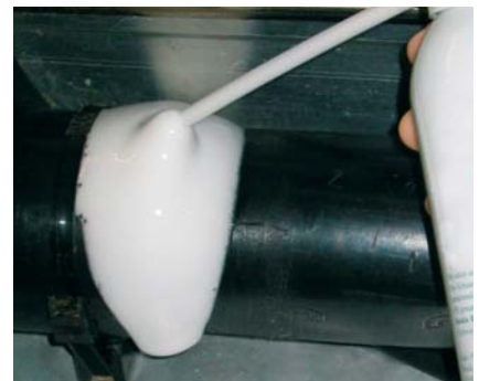
Coat suspicious areas – by hand if hard to reach.