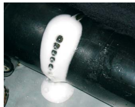
The leak is visible for several minutes.