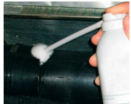
Spray a spot or...

The product is available in: Spray can 400 ml – 15 cans per carton PSI Article No. 4-016-00050