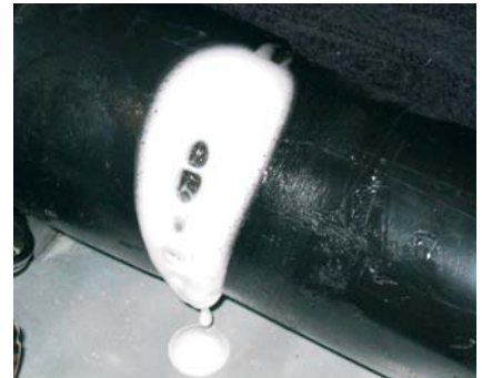
After a few seconds you see the first bubbles in the foam.